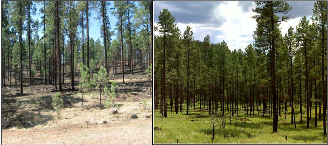
Wallow fire: an under-burned ponderosa pine forest on the Fort Apache Indian Reservation impedes fire advance.

The following two pictures demonstrate the effectiveness of active management to produce fire-adapted forests that reduce adverse impacts of wildfire.