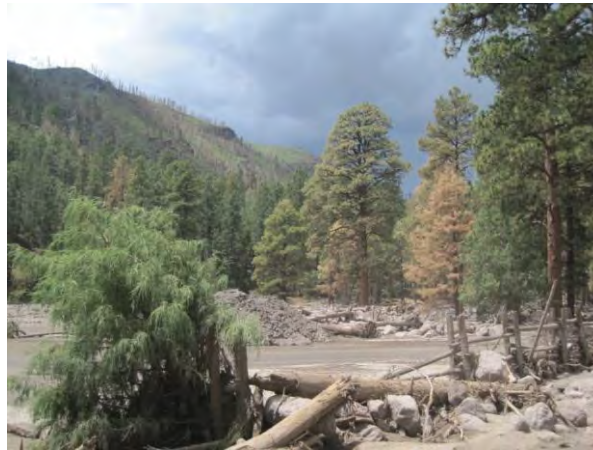
The TFPA can address hazardous conditions for wildfire which could damage lands and resources of concern to Indian Tribes. A series of three wildfires that originated on Forest Service lands affected the headwaters of Santa Clara Creek and contributed to severe monsoonal flooding, extreme erosion of the stream channel and sedimentation of water retention and fishing ponds of the Santa Clara Pueblo Tribe. July 2012.

Volume II contains several appendices that support and supplement Volume I: (A) the TFPA; (B) results of online surveys; (C) success stories; (D) site visit reports; (E) proposed training modules; (F) reference materials pertinent to TFPA implementation; and the (G) methodology used to conduct the investigation.