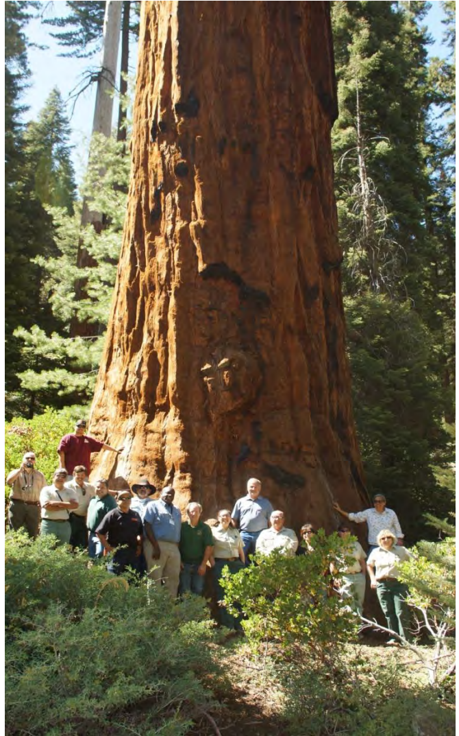
Sequoia NF –Tule River Reservation Site Visit July, 2012